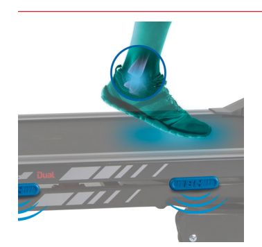
RUN + DAMPING SYSTEM

Elastomers with a special density that avoid the "rebound effect".